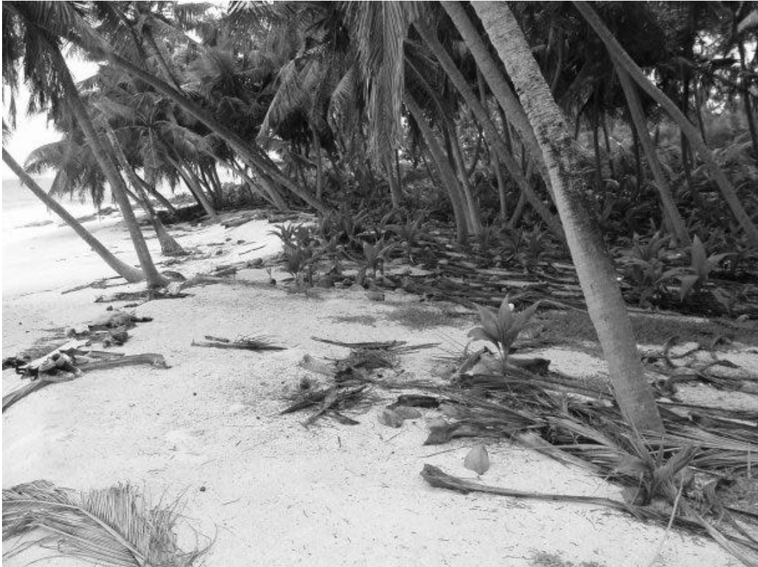
Figure 4. North Brother's thinning rim near the landing beach.

What of the corals themselves? These are critical for many reasons, one of which is that they grow, die and are turned into essential sand. The whole point of corals in this respect is to generate sand. I can end on good news. Underwater, no areas were found (yet) which were in any way stripped by the tsunami. This should not be surprising – after all, corals easily accommodate pounding storms and cyclones which last for days. In many areas, coral recovery is continuing very well following the massive mortality that took place in 1998. Many areas that were so depressingly devoid of live coral in the past few years now have 20, 30, even 50% of their substrate covered with young corals. This is not true everywhere yet, and many areas seem not to have recovered at all. But the corals are coming back slowly from their devastation of 1998. We can hope that those clones and clades that are returning are better warm-adapted than their predecessors were. They will need to be if they are going to survive far into the future given the general warning trends forecast for all tropical seas. The whole issue of the genetics and heat resistance of different corals is complex and alarmingly biochemical. It is one of the issues we will be researching in the 2006 expedition to Chagos, which will be focussing on many aspects of the longer term conservation and management of this extraordinary archipelago of reefs and islands.