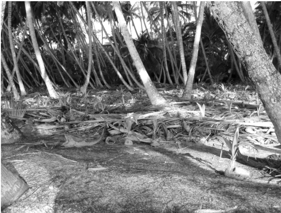
Figure 3. Eagle Island where all undergrowth was removed, including young palms and Scaevola . The ground vegetation here (2 months later) is only of newly sprouted coconuts. This is similar to the most heavily affected part of Diego Garcia.

In Salomon, more information was obtained from visitors on yachts than could be seen in our visit of just a few hours. Sand banks were shifted, and much sand apparently was pumped into the lagoon. Sand shifts around these islands seasonally, and probably the result of the tsunami was no more than an acceleration of this process. Anybody who did not know the area very well could think that nothing was out of the ordinary - there seem to be no areas of stripped vegetation. Observations of all shores and a walk around Ile Boddam, however, showed substantial erosion of the shores with 'steps' everywhere of 1-2 m high, and the yacht visitors reported that several turtle nests high on the shores had their eggs exposed, to be eaten by hermit crabs and, presumably, by rats.