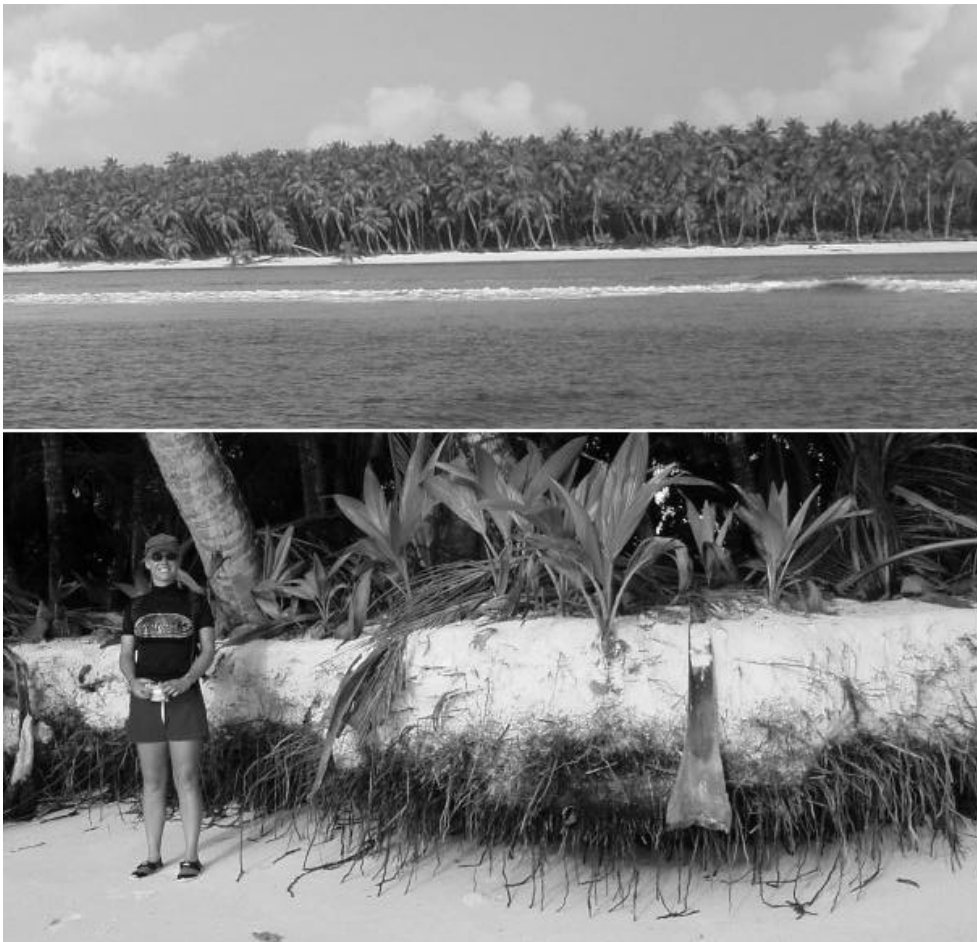
Figure 2. (Top). Section of Eagle Island with shoreline shrubs removed by the tsunami. (Bottom). Lee Morrison providing scale to the 1.5 m step

Spectacular results are fortunately few. In Diego Garcia's eastern arm, large waves clearly smashed through the vegetation along a section of a few hundred metres, but north and south of that there is no evidence of damage. Where the wave hit, the results are removal of the shoreline shrubs and of all young and intermediate-size palms, but most fully grown trees survived, leaving an untypical vista of palm canopy without undergrowth and a clear view all around. Working northwards through the islands: on Eagle island, facing east, there is a remarkable section of several hundred metres where the waves clearly punched 80 - 100 metres inland over a section of a few hundred metres, stripping away the Scaevola bushes and young palms (Figure 2). Now, two months later, this area has no undergrowth (Figure 3), but under the canopy of mature palms are masses of newly sprouting coconuts. This effect continued around the northern tip and down the western facing side for some hundreds of metres too, illustrating the complicated refraction patterns of the waves.