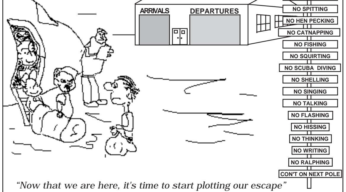
"Now that we are here, it's time to start plotting our escape"