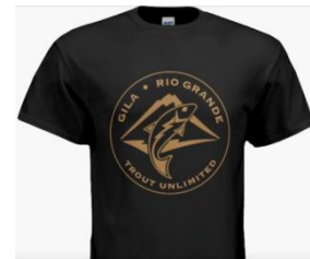
Peanut butter logo on black