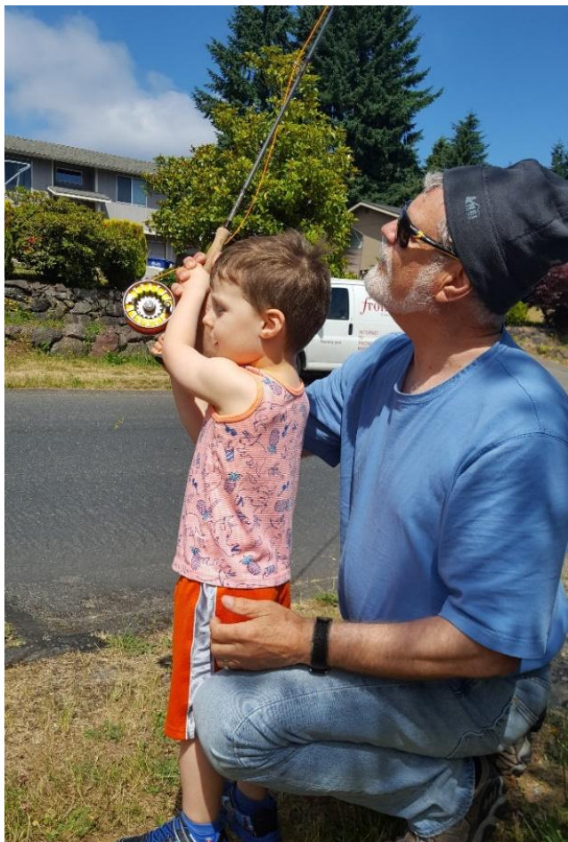
My younger grandson's first casting lesson

ways to do so is to take a kid fishing. Show them how to cast; talk about bugs and worms; teach them about the currents, winds and weather; identify birds and plants. Provide the opportunities, and they'll probably end up caring about at least some of what's out there.