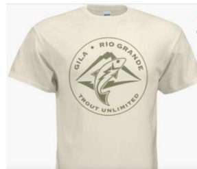
Green logo on ivory