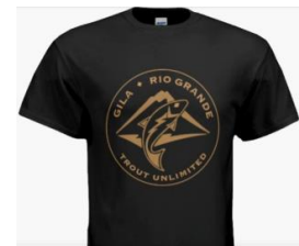
Peanut butter logo on black

If you are a current or former TU member looking to renew your membership please use the standard renewal form on the TU website: https://www.tu.org/trout-unlimited-3/ or call 1-800-834-2419.