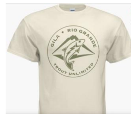
Green logo on ivory

Our beautiful T-shirts with the GRG-TU logo in colors: green-on-ivory, and peanut-butter-on-black are sold as part of our fund-raising for trout restoration and conservation efforts. These are great looking, well-made shirts for a great cause at only $20 each. Please include $5 for shipping if you want the shirt(s) mailed. Contact Jeff Arterburn to get yours, and to sign up for the next volunteer event: mailto:jeffgilatu@aol.com .