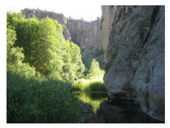
West Fork of the Gila