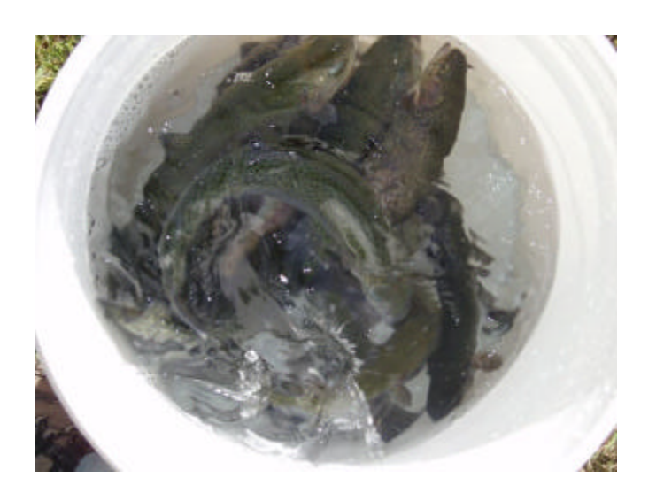
A Bucket Full of Rainbows

On November 6, about 350 rainbows were stocked at the lease. The fishing has steadily improved since the heavy rains from the late summer and early fall have ended. Recently a member reported catching an 18 inch brown. Give the lease a try over the holidays, but keep an eye on the weather.