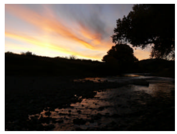
Sunset over the Rio Peñasco

We saw 6 other anglers on the lease, including the Watts from Lubbock who were kind enough to photograph some of the action. This is more anglers than we've encountered on the lease waters before, but there was still plenty of action. Miriam and I combined for 26 fish on hopper/dropper combinations, and we had a couple of rises to a parachute Adams. Unlike our two visits last month, nearly all the fish were caught on the nymphs, either a flash back PT or a copper john; perhaps half a