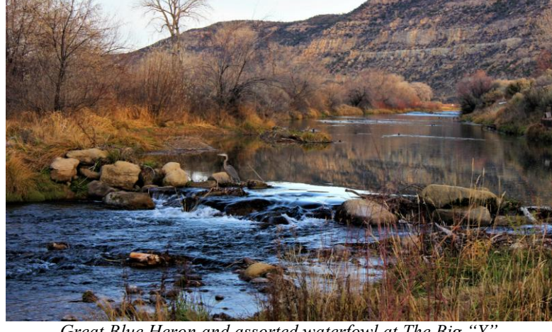
Great Blue Heron and assorted waterfowl at The Big "Y"

try when measured by the income levels of its residents, but it is rich in natural resources and cultural diversity. I am thankful that a fishery of the quality of the San Juan exists within our state and is accessible to us on public lands. I grateful that government agencies including the Bureau of Reclama-