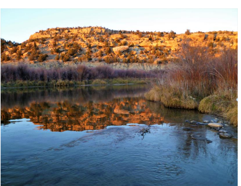
Somewhere on the Lower Flats

Americans, they still have some places of their own where they can be themselves on their own terms.