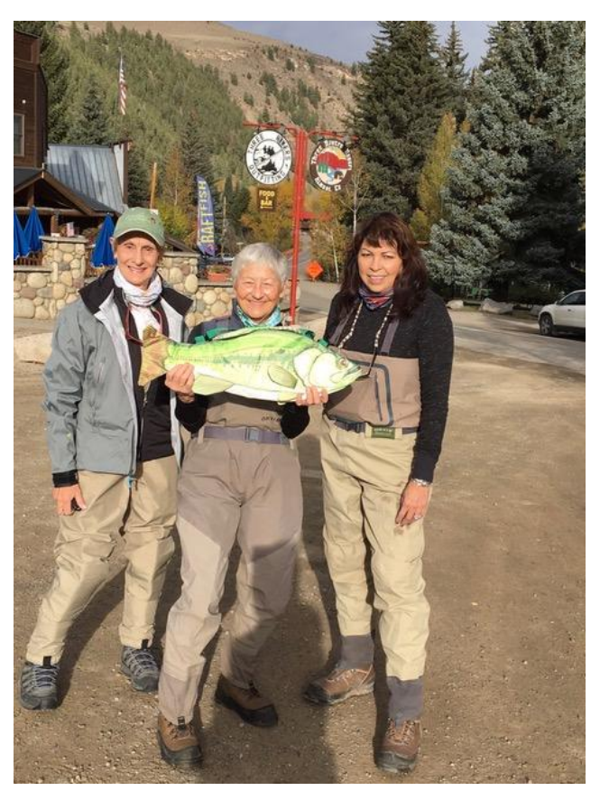
A rare Cervisia Sacculus Lake Trout caught in the Gunnison River.