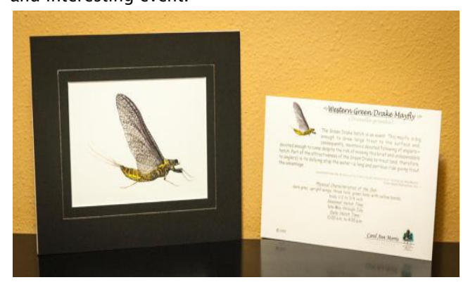
Wester Green Drake, watercolor/pen & ink Giclee print

ed an example of a Western Green Drake dun here as an example of the sort of exquisite work you can expect to see at our banquet. I hope you will make plans to attend what is shaping up to be an exciting and interesting event.