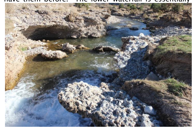
Facing downstream looking over what is left of the lower falls on the lease waters (the lip of the falls used to be about in the center of this photo)

When you next visit the lease, be prepared to become acquainted with a different river. The flood removed much of the silt and aquatic vegetation, has reconfigured many of the banks, and created new boulder runs and pockets of holding water where we didn't have them before. The lower waterfall is essentially