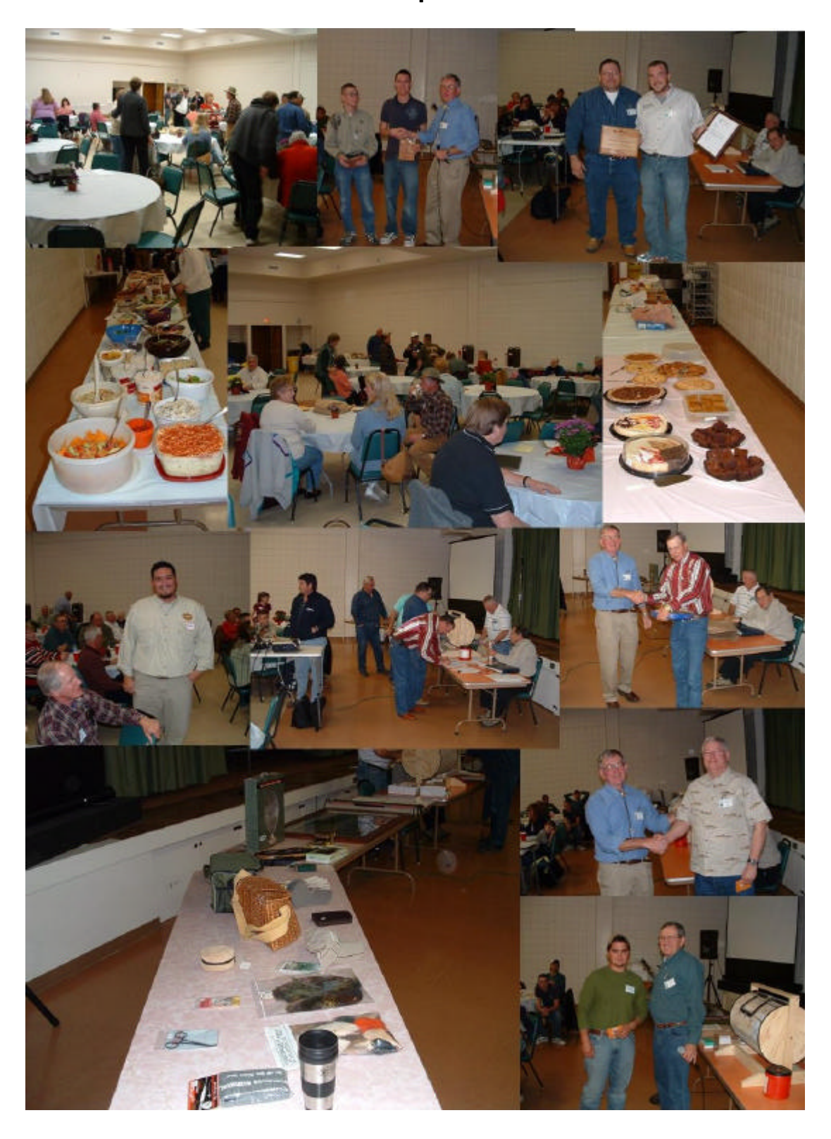
Annual Banquet - 2008