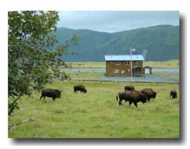
Buffalo along the Pasagshak River on Kodiak Island

Pictures of the Pasagshak can be seen at <a href="http://www.dnr.state.ak.us/parks/units/kodiak/pasagshak.htm">http://www.dnr.state.ak.us/parks/units/kodiak/pasagshak.htm</a>.