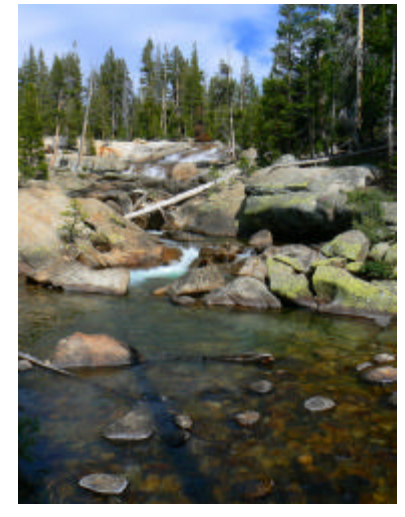
The Dana Fork of the Tuolumne River

both expensive and fully booked months in advance.