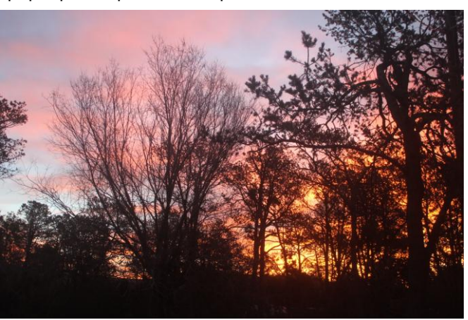
New Year's Eve sunrise over the Pecos River

sky transitions to a thin gray overcast of the sort that accompanies still air and aquatic insect hatches. The forest is enfolded in a thin blanket of clouds that seems to muffle the sounds of nature, as if the rivers, creeks and animals are easing through the forest in an effort to be more quiet than usual. Although the river below the village of Pecos is fishing well on Copper John nymphs, upstream we have the river and the woods to ourselves, except for the denizen of a pop-up camper trailer parked at the Mora River