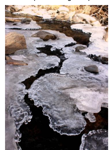
Ice formations on Upper Cow Creek

mountain mahogany are leafless spindles that provide little visual cover. The higher water flows of summer and early fall are greatly diminished; what were once