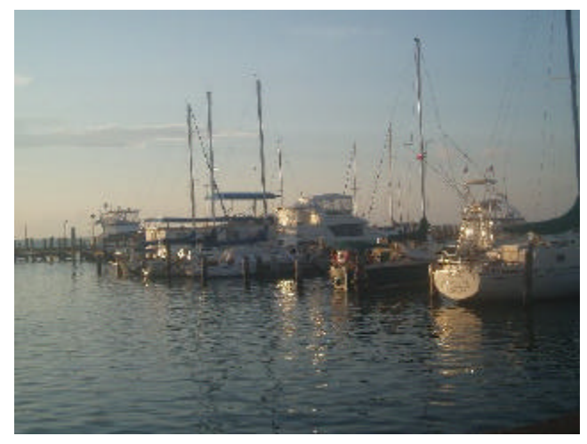
Fishing Boats at Port Aransas