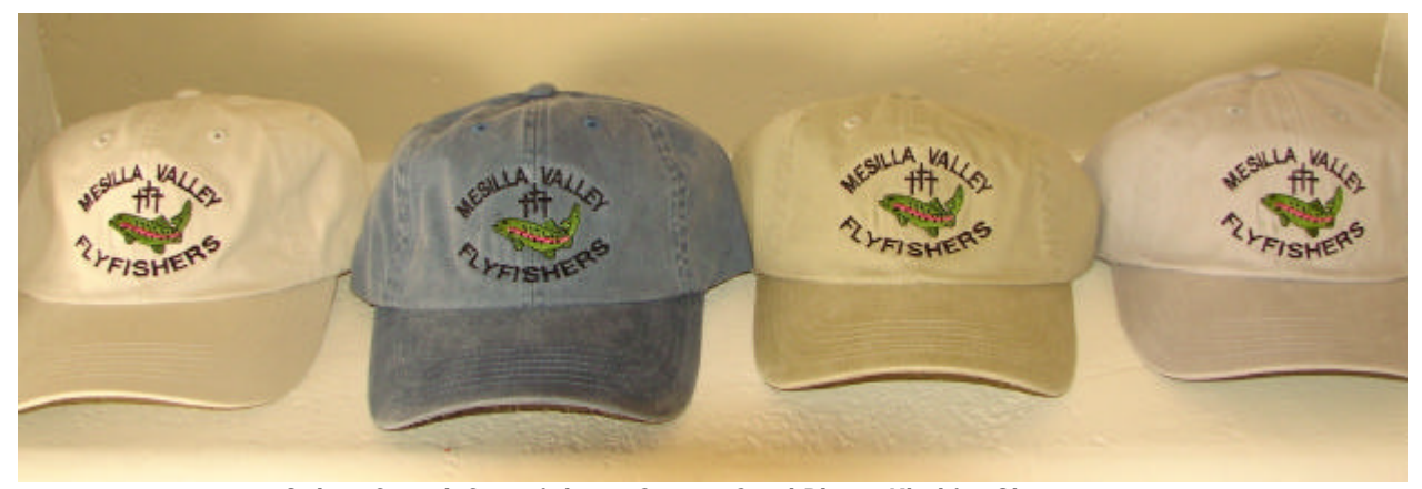
Colors from left to right: - Stone- Steel Blue - Khaki - Chrome