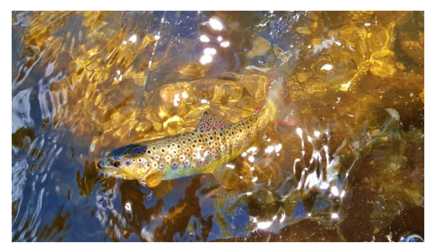
Colorful and feisty 12" Pecos River brown trout hooked on RS2 tied in PMD colors

adjustments to land management have also been effective at reducing congestion. The caused damage the by Tres Lagunas fire, and subsequent the flooding during the ensuing