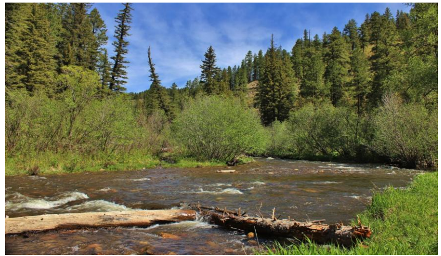
Pecos River between Terrero and Cowles

where stocker rainbow trout are reared to support the put-and-take aspect of the Pecos fishery. There are also a few monster 25+ inch trout hand on to illustrate how large the rainbows can grow, and