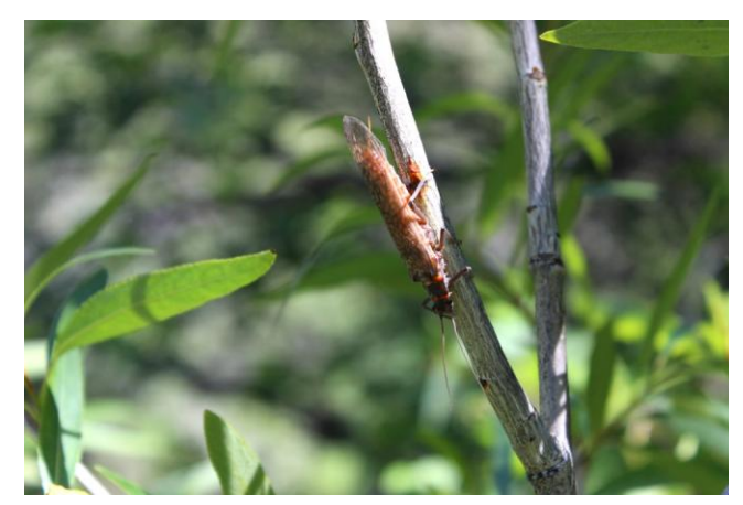
Giant stonefly (Pteronarcys californicus) near Dalton day use area

kinds of trout were responsive to different fly imitations. While most of the rainbows I caught hit large stonefly nymph patterns, most of the browns took size 18 mayfly emergers tied to imitate the PMDs. Also, because of the coloration of the rocks,