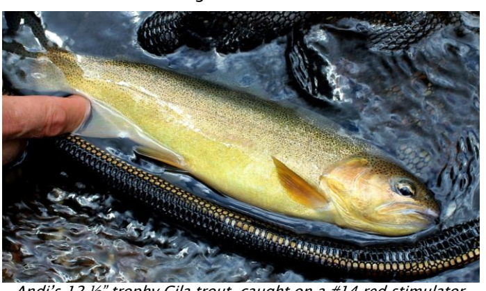
Andi's 12 ½" trophy Gila trout, caught on a #14 red stimulator