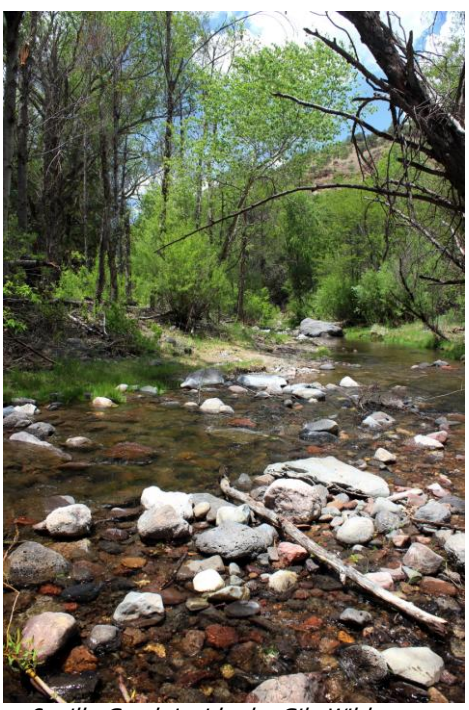
Sapillo Creek inside the Gila Wilderness

Some fly anglers from outside our region do recognize the significance and value of seeing, catching and touching Gila trout, treating them as trophy fish.