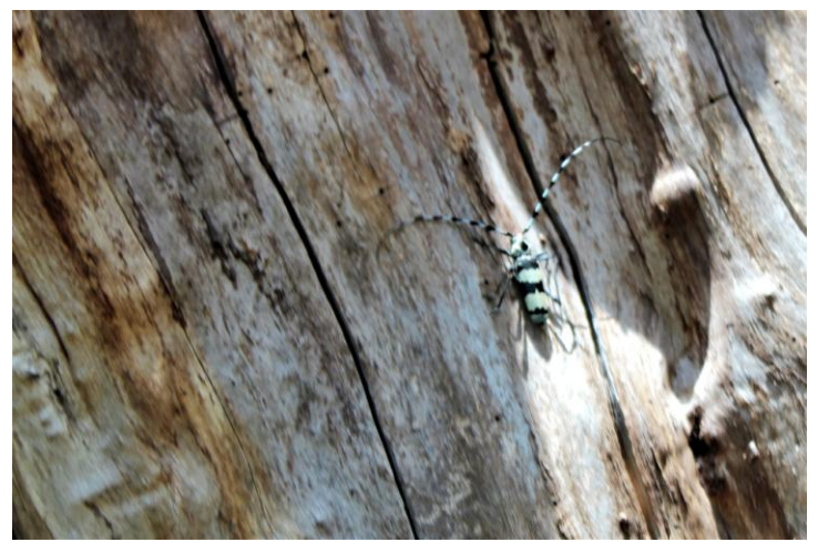
Banded Alder Borer (Rosalia funebris) observed along Sapillo Creek

the 20 inch class have been stocked in Lake Roberts and several streams in the Gila, the size for most wild Gila trout is from 5 to 9 inches. Their life span is typically 4 with some years, known to reach 6 vears. In small streams where growth is limited, Gila trout generally spawn for the first time at three