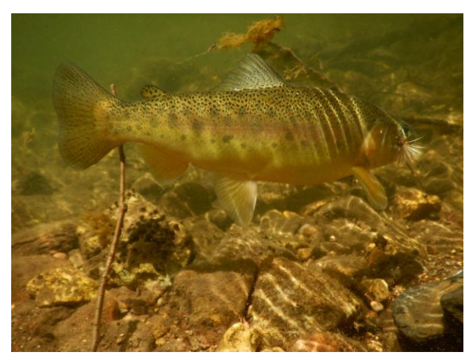
Rainbow/Gila trout hybrid (?), Sapillo Creek

with pepper sprinkled on top. Although the new reg-