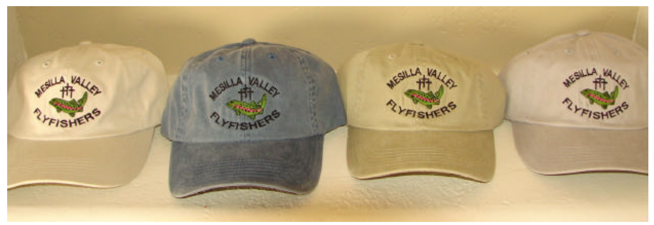
Colors from left to right: - Stone- Steel Blue - Khaki - Chrome

Available in Khaki, Steel Blue, Stone & Chrome Cost $15.00 with all proceeds going to the General Fund Add $5.00 for shipping if needed Contact Ron Warnke (575-532-5600) or warnke@mvff.org to order