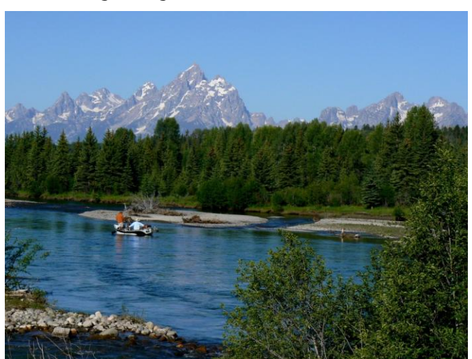
Snake River, Grand Teton National Park.... A good place for oil and gas drilling?

move about 60% of U.S. streams and 20 million acres of wetlands from protection. Additionally, it will once again allow mining companies to engage in mountain top mining, and discharging tailings into headwater streams. A group of sportsmen organizations, including the American Fly Fishing Trade Association, Trout Unlimited, and the Theodore Roosevelt Conservation Partnership have prepared a statement supporting the Clean Water Rule. If you are interested in