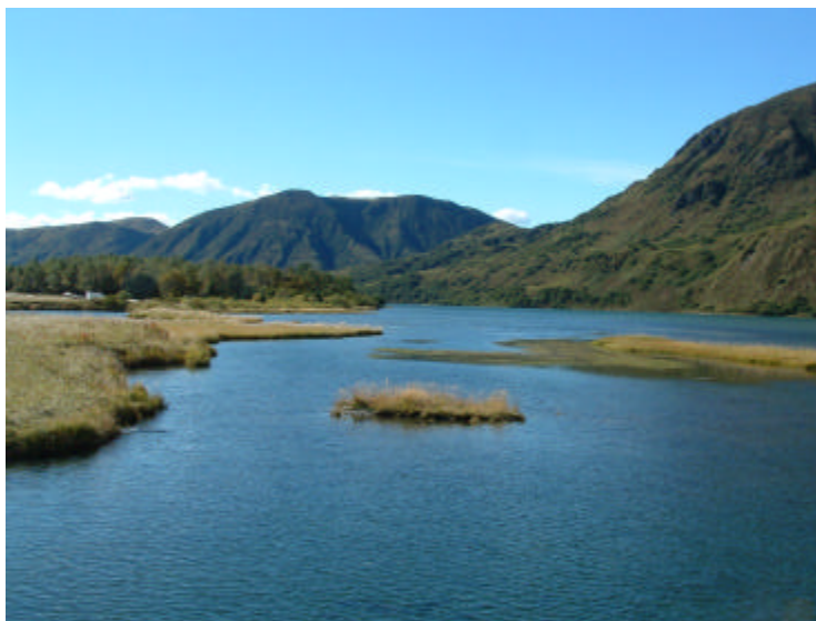
Pasagshak River, Kodiak AK

<> <> <> <> <> <> <> <> <> <> <> <> <> <> <> <> <>