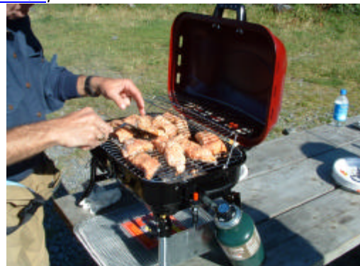
Kodiak lunch - just caught salmon on the grill.

fm/FA/kodiakRoads.overview . Kodiak is a beautiful place. To see some live pictures of Kodiak go to http://akweathercams.faa.gov/viewsite.php . Pictures of the Pasagshak can be seen at http://www.dnr.state.ak.us/parks/units/kodiak/pasagshak.htm ,