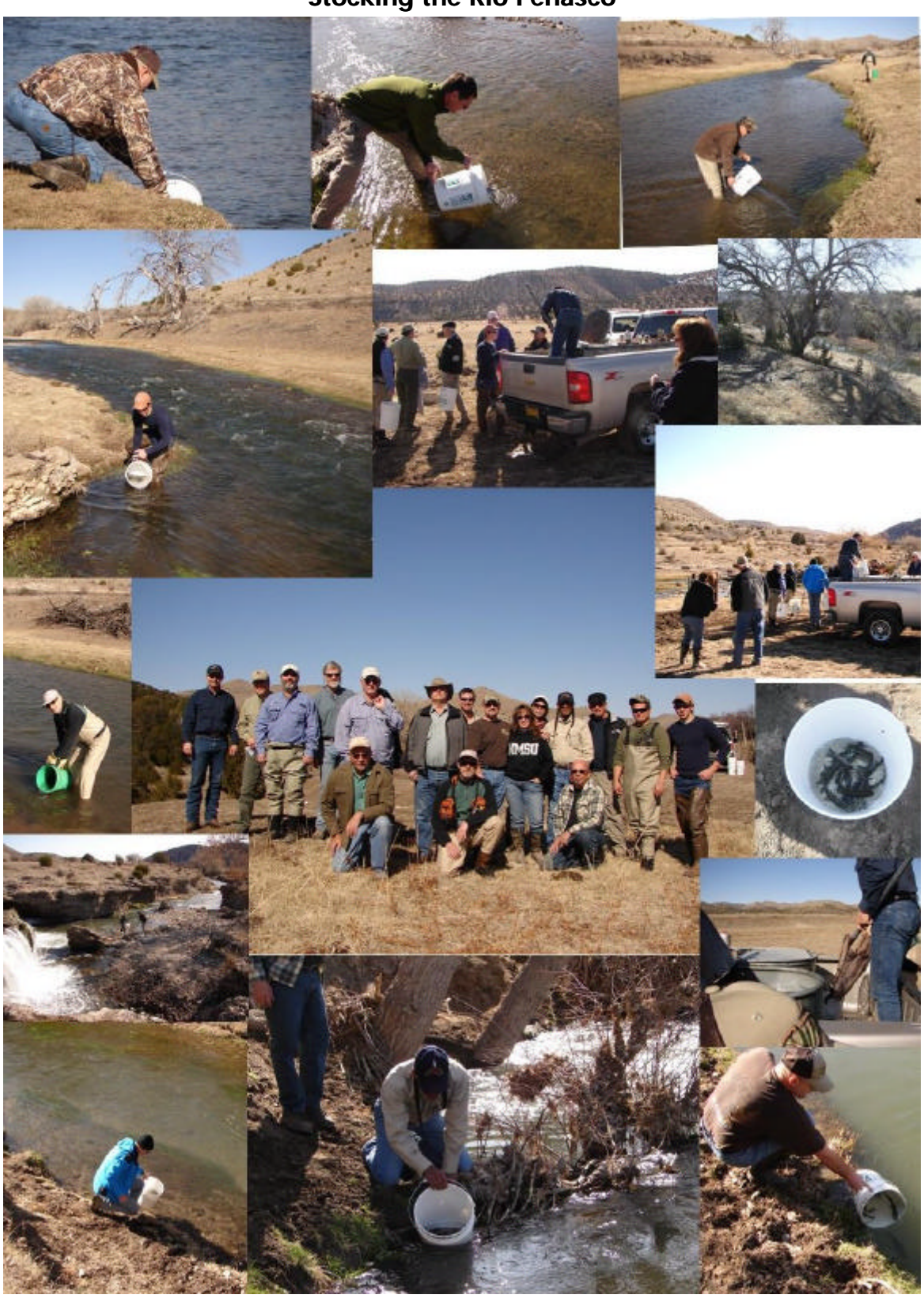
Stocking the Rio Peñasco