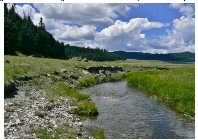
San Antonio Creek

are many archeological sites and Native American sacred areas on the property that need to be managed as well. Important progress was made in fisheries restoration, including replacing culverts that had blocked the movement of fish, and excluding livestock from the riparian areas. However, despite charging higher than average fees,