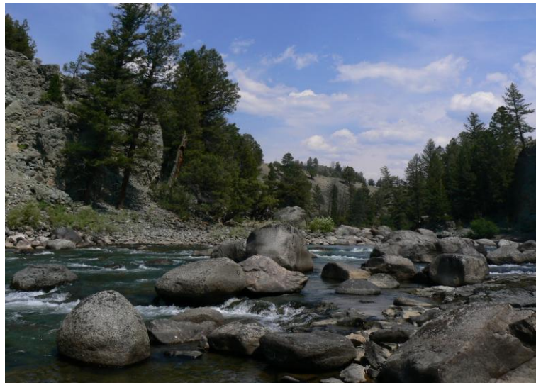
Lamar River, Yellowstone National Park.... A good place for oil and gas drilling????

Waters include the small streams that are being used for the reestablishment of Gila trout and Rio Grande cutthroat populations. Quality Trout Waters include