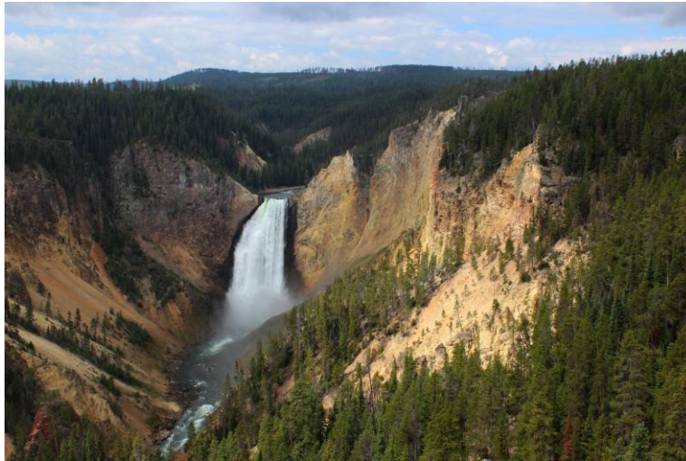
Yellowstone Falls, Yellowstone National Park