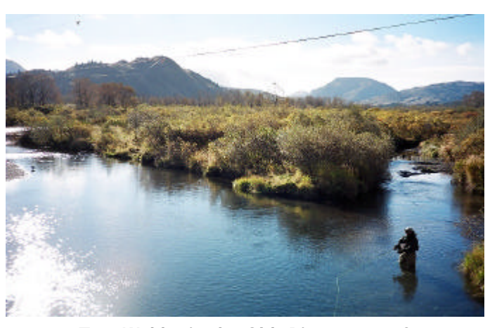
Tom Wobbe in the Olds River - one of our favorites

home. Every morning as we were leaving, vans from various flying services would be picking up groups of " sports " who were flying to the remote parts of the island that could be reached only by floatplane. Sometimes we would see them again that evening if the weather was bad. We met people that had been fishing the Road System for more than 20 years. No matter the weather, if you can get to Kodiak, you can fish the Road System. We saw bald eagles, seals and sea lions, bears, and deer.