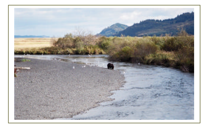
We encountered local fishermen!

Finally, the first bunch of grey Silvers slide into the pool I was fishing. AI saw them too and pointed them out. Their backs were dark grey and their sides very light silver. They were big and fresh from the ocean, which we could hear just a half mile away. Everyone stared for awhile. I know I was awestruck with the idea that this was the quarry, and I really was in Alaska fishing for them. No one said much, but we all must have had the same feelings. The bite on the Pasagshak was off that day. No one caught a Silver, but we got used to fishing with the bigger rods and large flies. We soon learned that fishing for salmon is nearly the same as for trout. The presentation, drift, and retrieve are very important and the fish will spook if not approached carefully. The next day, after a good night's sleep, we fished