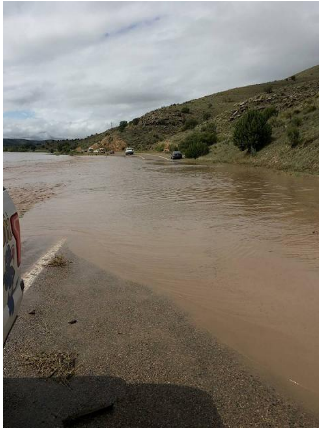
Rio Penasco floodwaters inundating NM 82, mile 51–52

Photographs taken from NM 82 show that between mile markers 51 and 52, in the area of Mulcock Ranch, the floodwaters actually covered part of the highway.