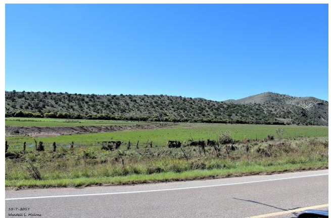
The same stretch of the valley after the flood receded

Figuroa and Wendell Malone.) It seems pretty clear that the loss of forest cover in the burned headwaters areas contributed to the amount of runoff. Neverthe-