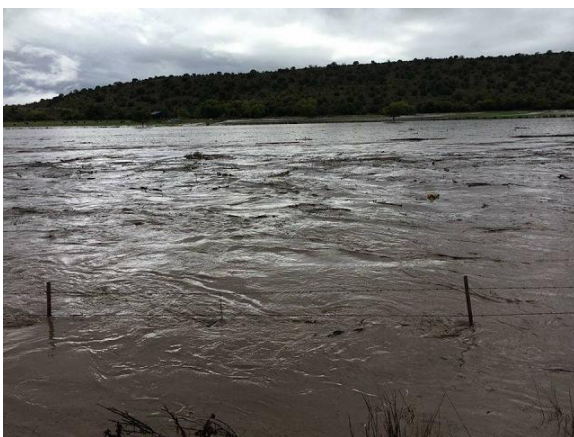
“Lake Penasco,” looking south from NM 82, mile 51–52, during flood

created a model that accurately reflects current rainfall conditions and suggests that future changes could have significant consequences for regional wa-