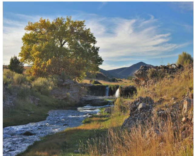
Quieter times on the lower lease, Rio Penasco

The leaves are changing, there is a chill in the morning air, the deer and turkeys are active all day, and it is possible to fish to a BWO olive hatch in complete solitude if one so desires. Some years I've even celebrated Thanksgiving on the lease, enjoying a shore lunch of smoked salmon or turkey jerky, fresh apples, dried cranberries, and pumpkin bread. I hear some club members will be on the river for this Thanksgiving, and I wonder how they will find