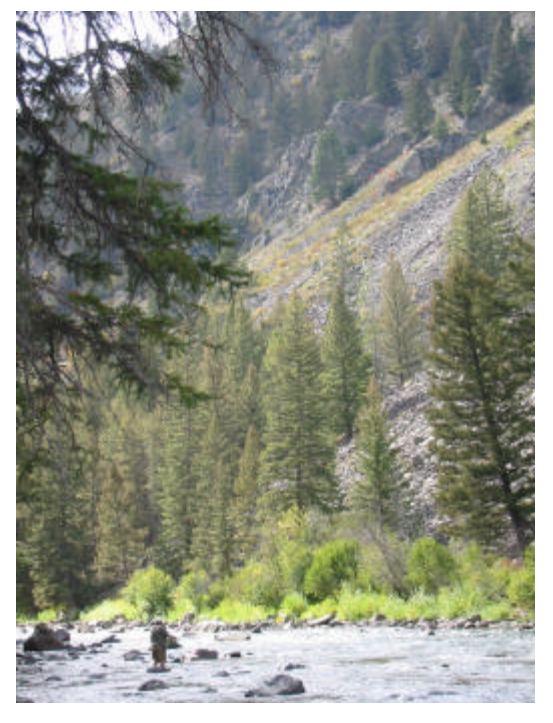
Fishing the Gallatin