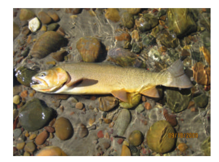
Fish Creek Cutthroat