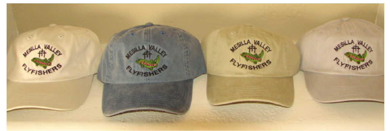
Colors from left to right: - Stone- Steel Blue - Khaki - Chrome

Available in Khaki, Steel Blue, Stone & Chrome Cost $15.00 with all proceeds going to the General Fund Add $5.00 for shipping if needed Contact Ron Warnke (575-532-5600) or <u>warnke@mvff.org</u> to order